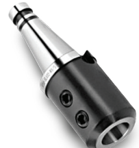
SIDE LOCK ADAPTORS