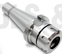
ER SERIES ADAPTORS