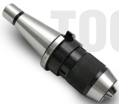
INTEGRATED KEYLESS ADAPTOR