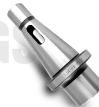
MT REDUCTION ADAPTORS