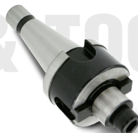
FACE MILL ADAPTORS